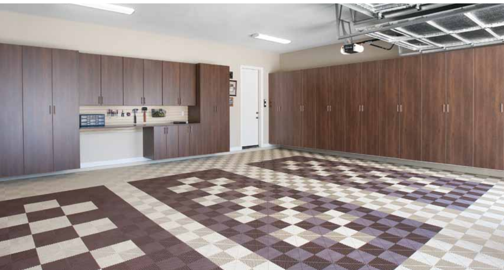
Above: Coco cabinets offer an upscale feel with a smooth transition into the home. A long bank of tall cabinets, coupled with a large work area with upper cabinets as well as drawer space, provides convenient yet ample storage.