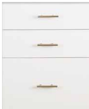
White + Stainless Bar handle