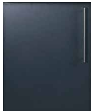
Powder Coated Granite + Stainless Bar handle