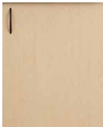
Maple + Bronze Arch handle