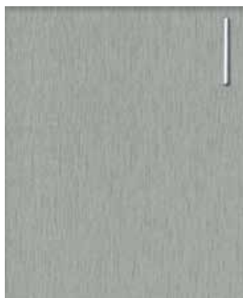
Slate/Silver + Stainless Bar handle