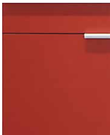
Powder Coated Red + Aluminum handle