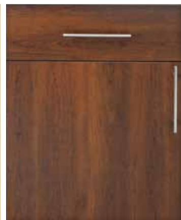
Coco + Brushed Nickel Bar handle